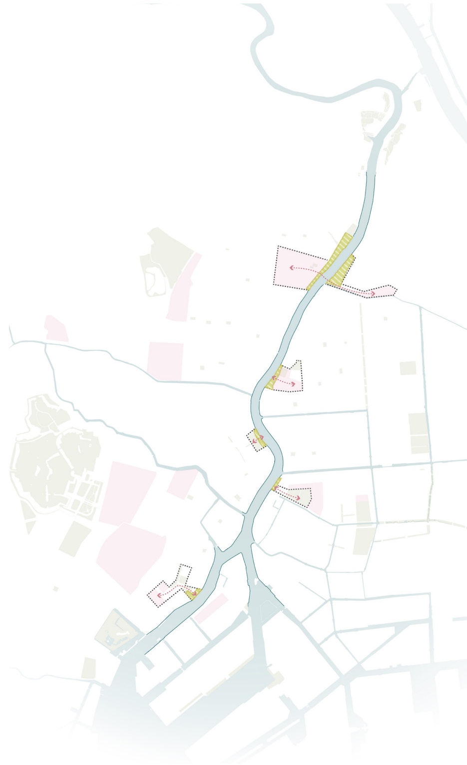
2. Integrating important public spaces into the river space